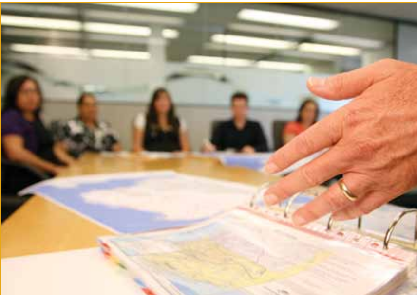
The Native Title Act sets out the correct processes for future acts. Following the correct processes enables council to ensure proposed future acts will be valid.

A low impact act can take place over an area before a determination is made that native title exists without public notice or negotiation with any potential native title holders. A low impact act may no longer be regarded as a low impact act once a determination has been made that native title exists in an area.