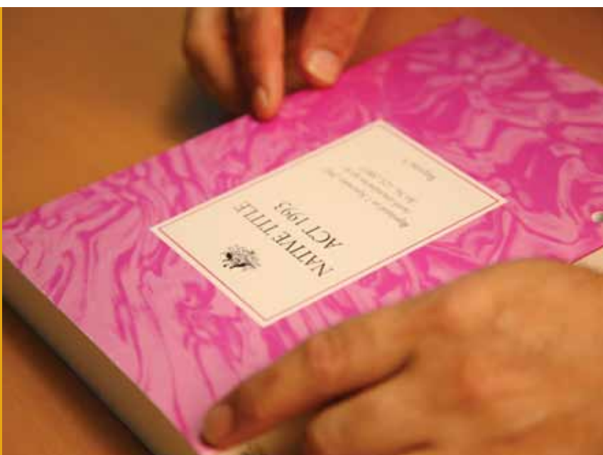
The Native Title Act commenced in 1994. Local government activities may trigger the native title compliance procedures detailed in the Act.

This brochure provides a general overview of the statutory native title compliance regime for future acts and also explains how a council may use an indigenous land use agreement (ILUA) to fulfil its obligations.